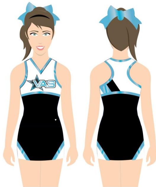
Prepared for Vancouver All Stars - G Force Gym

Uniforms for 2011-12: After 10 years of using the same black VAS uniform, we will be getting a new, updated look for our Level 1 Program. We will still use a basic uniform to keep the cost down and it will be used for the next 5 plus years so that you can sell it used and make it an investment with a high-return value. We predict that they will run at approx $140 and that you will be able to resell the for $90-$100.